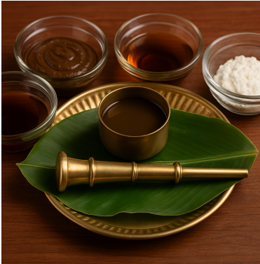
Vasti Netra & Dravya