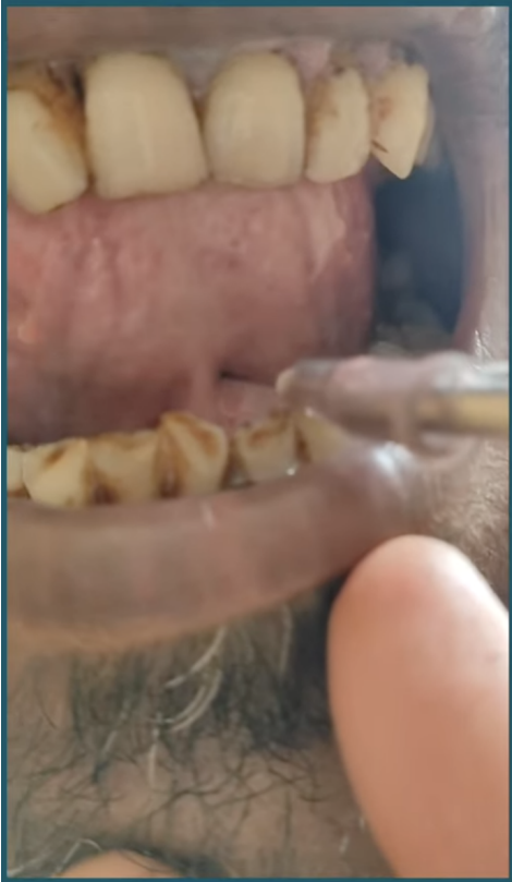
Viddhakarma in mouth ulcer