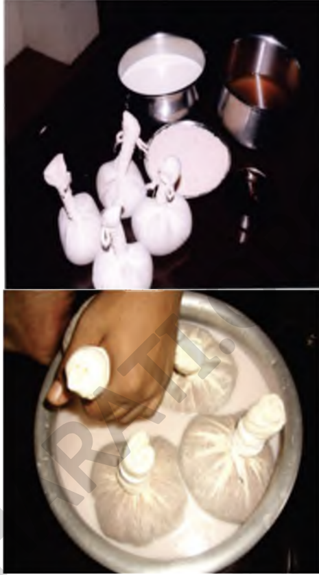
Image 2, 3: Source - https://ccras.nic.in/wp-content/uploads/2024/06/Evidence_based_Ayurvedic_Practice.pdf