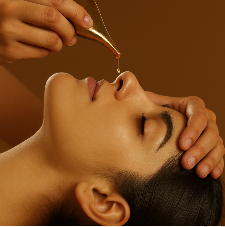
Nasya Karma (instilling medicated oil)