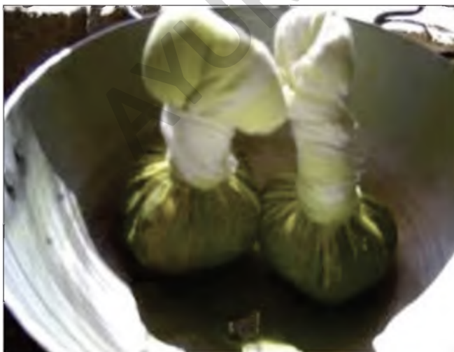
Image 2: